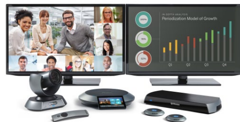
Lifesize® Icon 600™ with optional two-display configuration for screen sharing, Lifesize® Camera 10x™, plus Lifesize Digital MicPods attached to Lifesize Phone HD for large rooms.

*Not applicable with Lifesize® Icon 400™ or Lifesize® Icon 450™